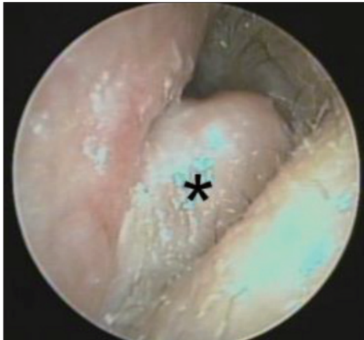
Fig. 1. Otoendoscopic examination reveals a soft, non-tender, smooth skin-colored mass lesion (asterisk) blocking the external auditory canal.

of the left EAC. Though the cystic wall was slightly enhanced, cystic fluid showed low attenuation on contrast enhanced TB CT (Fig. 2). There was no evidence of invasion or destruction of surrounding soft tissues or bone.