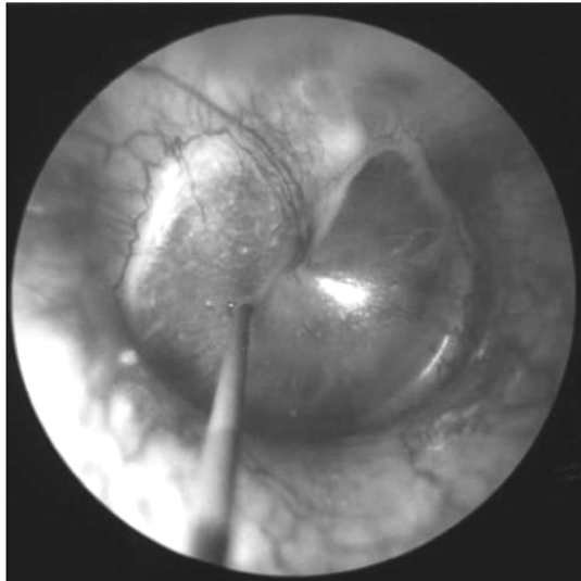
Fig. 1. Transtympanic electrode of electrocochleography.

(dehydrating test), 73.5% 가 . 4)5) furosemide . 전기안진검사 . 가 48% . 2 10 dB . 가 12% . 10 dB . 5 dB가 . 6)