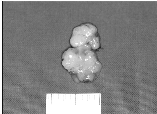
Fig. 3. Gross specimen finding. A yellowish mass measuring 2.0 x 1.5 x 1.0 cm is seen.