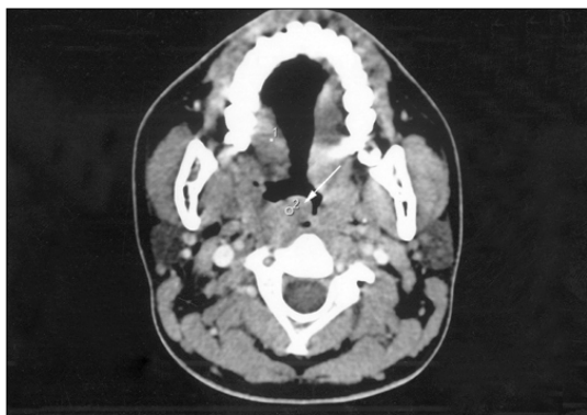
Fig. 2. Preoperative axial CT scan at low maxilla level. About 2 x 2 cm sized mass (white arrow) is seen at post-rolateral aspect of right nasopharyngeal lumen.