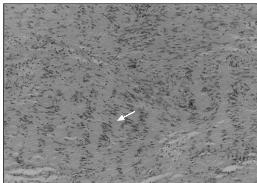
Fig. 4. Antoni A areas illustrating nuclear palisading with formation of the Verocay bodies (white arrow) (H & E, x 250).