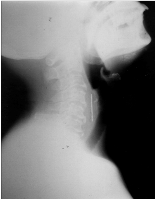
Fig. 1. Lateral view neck shows metallic foreign body.