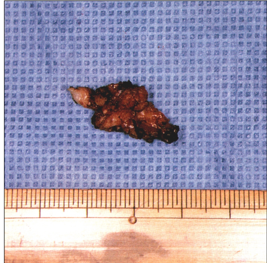
Fig. 3. Gross finding of removed tumor (1 x 1 x 1.5 cm).