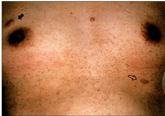
Fig. 2. Photograph showing the numerous freckling, subcutaneous peripheral neurofibroma (black arrow) and cafe-au-lait spot (open arrow) on the anterior chest.