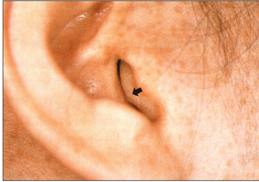
Fig. 1. Obstructing mass on the right external auditory canal.