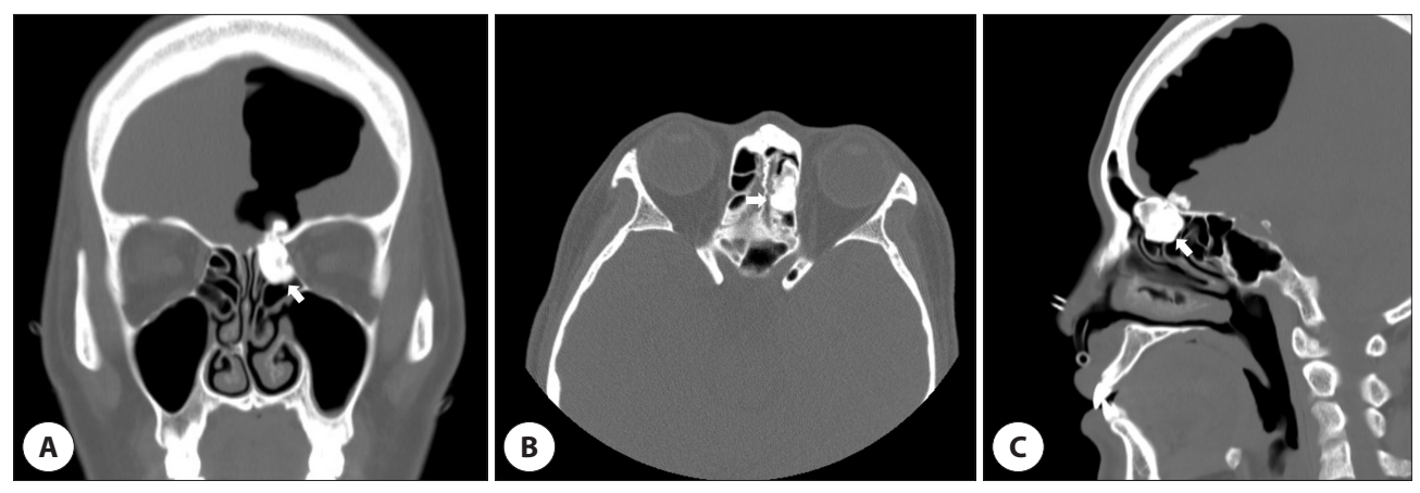
Fig. 1. PNS CT images showing approximately 2.4×1.8-cm-sized ethmoid sinus osteoma(arrow), extending to the skull base from the left ethmoid sinus roof that caused approximately 5.3×3.7-cm-sized pneumocephalus. A: Coronal view. B: Axial view. C: Sagittal view. PNS: paranasal sinus, CT: computed tomography.

During operation, the osteoma in the ethmoid roof was exposed after ethmoidectomy (Fig. 2A). After confirming the osteoma on the ethmoid sinus roof, most of it was removed using a drill. Then, the attachment site of the osteoma to the skull base was exposed, and its remnant was removed using a curette to minimize damage to the dura. The removed osteoma had a smooth surface on the side of the ethmoid sinus and a cystic polyp on the intracranial component, which appeared as a soft tissue density on the CT scan (Fig. 2B). After the removal of the osteoma, a 2×1 cm defect occurred in the dura mater at the skull base attachment of the osteoma, and shrinkage of left anterior brain was observed (Fig. 2C). The surgery was completed after multilayer reconstruction of the defect using tachosil, duracell, and nasoseptal flap. The aphasia improved 3 days after surgery, and normal