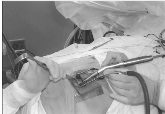
Fig. 2. The patient is rotated toward the surgeon to obtain the appropriate surgical view.

Ar- my - Navy 가 (Fig. 2). 가 1 cm 가 (Fig. 3).